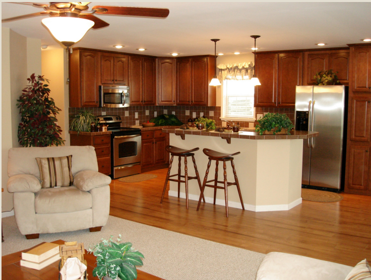
Kitchen W/ 42" Overhead Cabinets, Mocha Maple