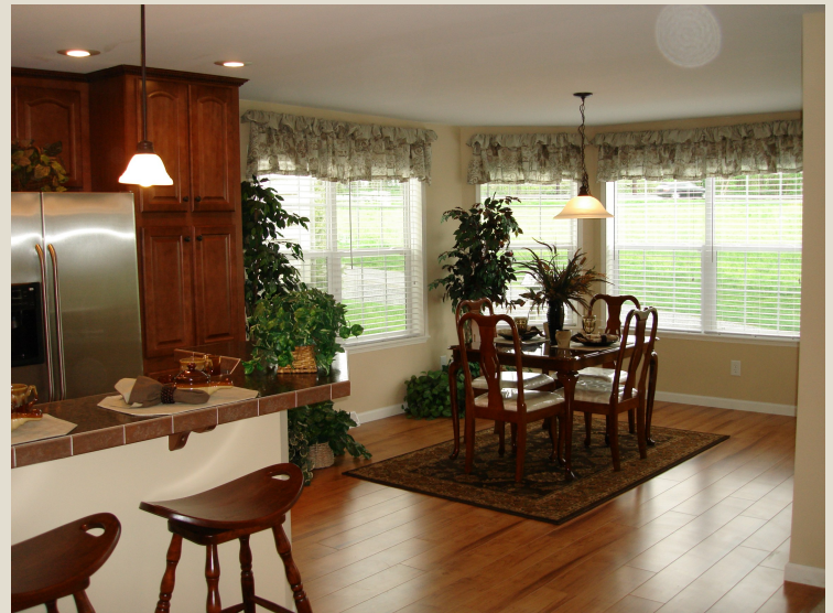
Kitchen Looking Into Morning Room

3517 Lincoln Hwy. East Kinzers, PA 17535